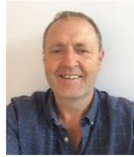
Noel Beamish Dover Outreach Centre