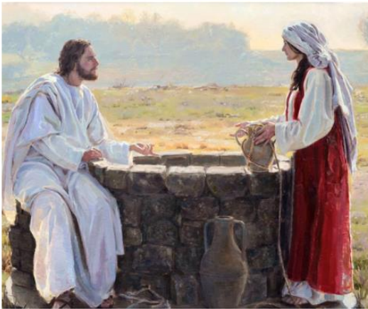
A spring of water welling up to eternal life

The Samaritan woman was at the well to draw water. Fortunately for her, she found the Lord and the Lord found her. So, instead of drawing water from the well just for her daily drink, she was able to draw eternal life from the Lord. From whom or from where do we draw life? This question can be answered on several levels. Maybe we draw life from our spouses as we experience their love. Perhaps we draw life from our children, or grandchildren, whenever we rejoice in their talents and achievements. We may draw life from the fulfilment and satisfaction provided by our work that makes a real difference to the quality of life for us and for other people. Or we may draw life from our hobbies that renew our enthusiasm for life. But on a deeper level, at the depths of our being, from whom do we draw life? For us Christians, there is only one completely satisfactory answer to this question. We draw life from God, the sole author of life. From him, we have life in all its fullness, and through his Son Jesus Christ. The fountain of living water is to be found with Jesus: a fountain from which eternal life gushes.