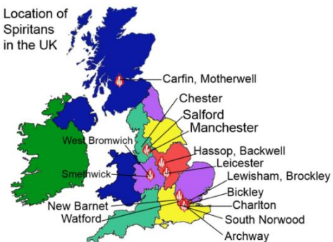
Location of Spiritans in the UK