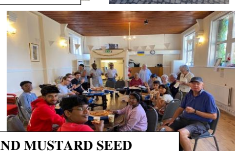
MEMBERS OF THE JUNIOR YOUTH GROUP AND MUSTARD SEED