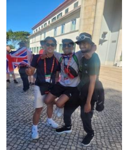
MEMBERS OF THE ADULT YOUTH GROUP- FAMILIA UNA